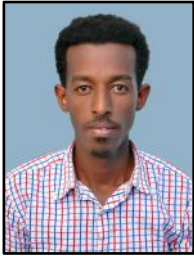
Endale Gatachew Village- Yatoo Reached 20 People