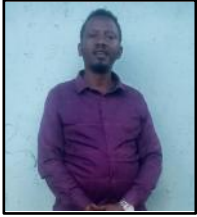
Antena Kebede Village- Purustale Reached 18 People