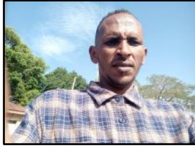
Bahilu Nagaro Village- Wenchee Reached 15 People