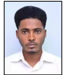
Mekesa Kebebe Village- Armaya Reached 2 People