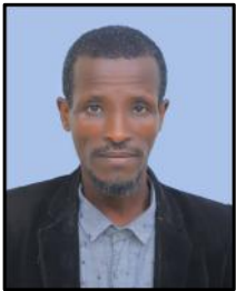
Marcos Anadisu Village- Silt'e Reached 4 People