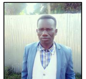
Taso Bahiro Village- Bonga Reached 22 People