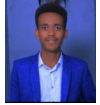
Samuel Elpa Village- Goba Reached 23 People