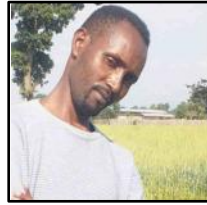
Gezow Berera Village- Manderand Reached 20 People